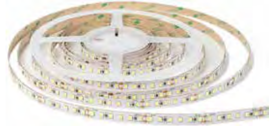
IP65 Surface Silicone Extrusion Molding: